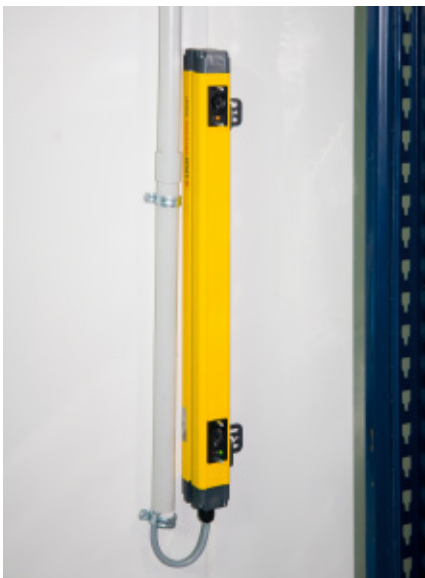
External safety sensor

Movirack mobile racks are suitable for frozen storage installations since the energy consumption per stored pallet is much lower due to the optimised volume of the chamber