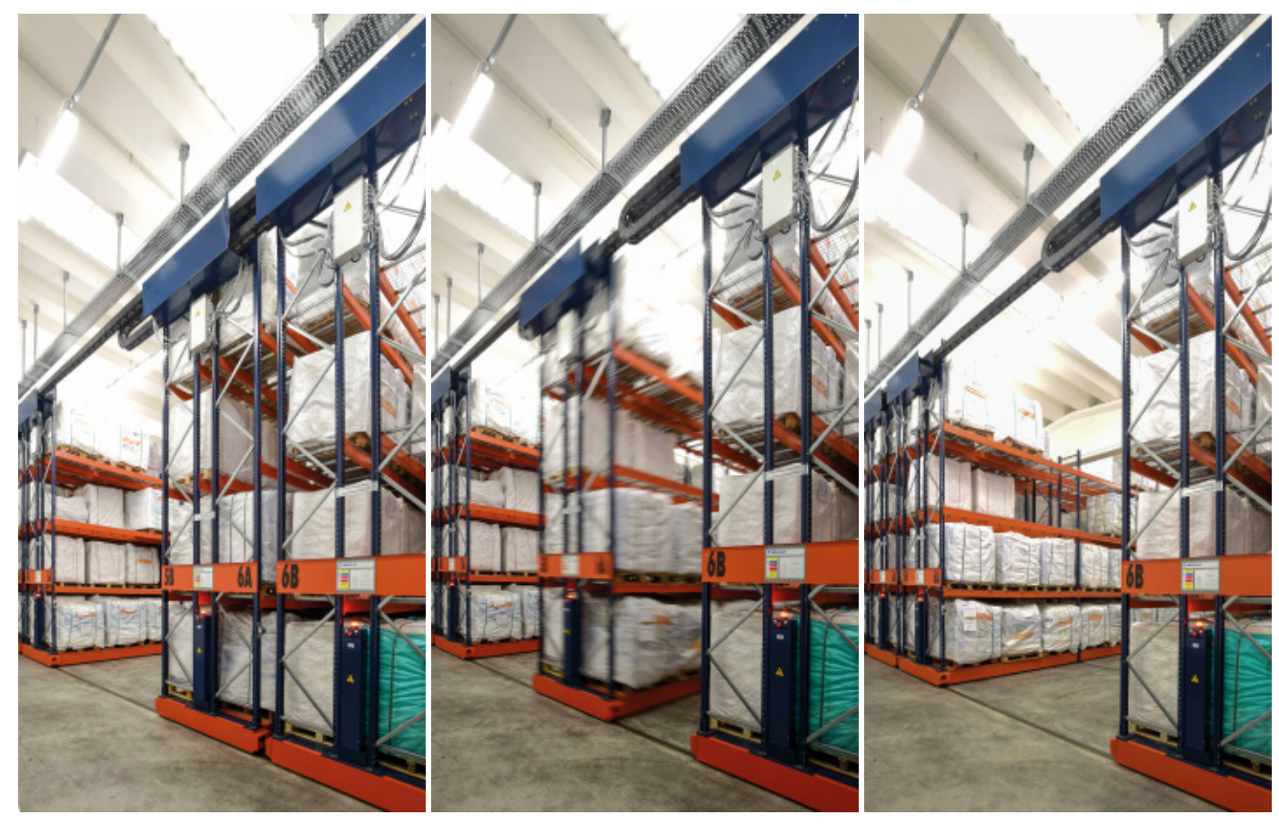
The images show how the Movirack mobile pallet racking system works