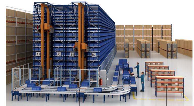
Product-to-person: the conveyors automatically bring the boxes to the pick stations

Each pick station is equipped with a computer connected to Easy WMS and with carton live storage where the products are placed into cardboard boxes (each one comprises an order). In total, up to 30 orders can be prepared. To help employees minimise errors and enhance efficiency in picking, each location is equipped with a put-to-light device that lights up and displays the number of items required.