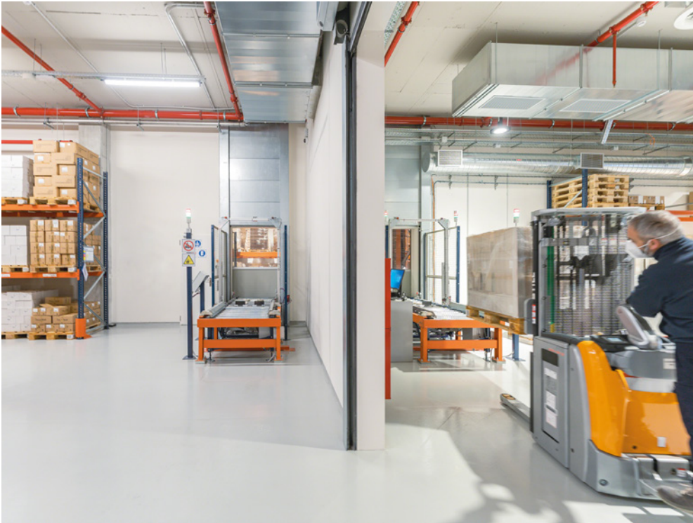
All inbound and outbound goods access points in the automated warehouse are reversible.

To gain in capacity, Mecalux dug an 8-metre-deep pit where it set up taller 12-metre racking. These racks occupy all of the area's useful space, with entry and exit points and conveyors placed strategically alongside them. The objective was clear: "We wanted to make the most of the limited space we had to obtain the largest number of locations possible," emphasises Pilar López.